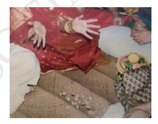
Fig.06. The Cowry Game

In East Bengal families after the sampradana , the bride and the bridegroom are taken in a room and they are seated on a bamboo shoot mat. Then bridegroom is offered rice pudding prepared by the mother of the bride. The bridegroom makes a mark on the rice pudding with his ring, then he smells it and throws it away. After this, the bride and bridegroom play cowry under the supervision of the eyos (Fig.06). Twenty one cowry shells and bridegroom's ring are required for this game. The couple individually takes all the twenty one cowry shells and the ring in their hands respectively and throw it back into the mat. The maximum number of inverted cowry shells decides the winner (Choudhurani,2006:102). The inverted cowry resembles female organ. So again this game is connected with fertility. Cowry is also used as a medium of exchange during early medieval and medieval times. So this game is also related to prosperity. The game of cowry is also a part of the marriage rituals of some of the indigenous people of Bengal like the Rajbansis (Sanyal,2002:111-112).