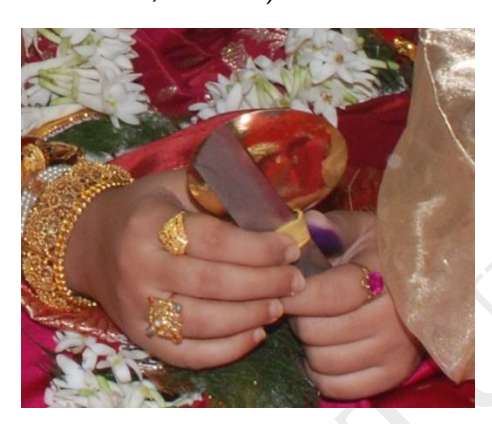
Fig.05. Bride carrying a Metal Mirror and Knife

bridegroom, depending on their respective family customs, during the total period of the wedding ceremony, in order to protect them from evil eyes. In the Mymensingh region of Bangladesh girls carry a metal mirror and knife (Fig.05), and this is given at the time of the nāndīmukh ritual (Choudhurani,2006:97).