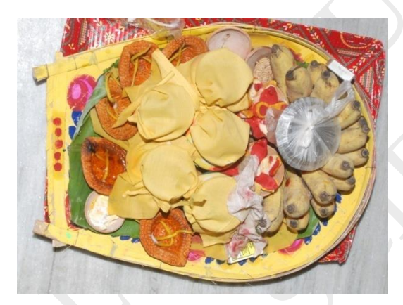
Fig.01. Barandala of a Brahmin family of Mymensingh

cowry shells, seven areca nuts, seven pomgrenate flowers are kept), a gachkouṭo, a kajallata (a vessel used for making collyrium), a nut cracker and a kunke or a vessel for measuring rice(containing a small comb, a mirror, a garland, girdle, collyrium and bangles of conch shell and iron) are kept (Saha, 2017:18). Śrī is a beautiful small pyramidal structure made up of rice powder paste, turmeric and vermilion and kept in a small plate by pouring mustard oil over it. An alternate of Śrī is the aīyomuchi or the nichni-pichni of the Mymensingh families(Choudhurani,2006:26-27). These are small petal like structures made up of the same ingredients as Śrī and kept in two small earthen plates in the Barandala.