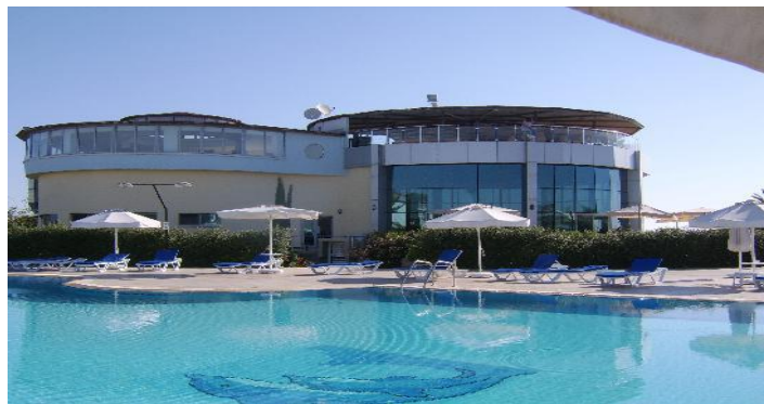
Figure.4. Hotel (A)

The overall visage of the plan was extremely unshaped and undesirable in a way that the visitors at the first glance are being bombarded by the negative senses of likely being at a convict cincture. The colour and the used materials in the building are miles away from the harmony it should have been regarded the Cyprus overall environment. “The building has no identity by itself and there is also no sign or symbol around the building to introduce its utility to the visitors”. Instead of using the potential beauty of the rocky seashore, it has been tried to remove the rocks away and built sandy seashore which the results was neither sandy nor rocky. Because of the natural forces the carried sands were being washed by the sea.