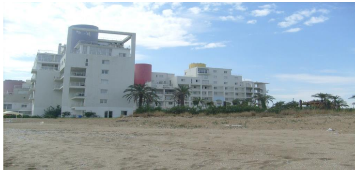
Figure.6 Hotel (B) External view

The significant problems of the building's planning failures are: its lack of an entrance gate, any logo or sign, no harmony, lack of suitable illuminating systems, a proper sewage system and waste disposal. To put it in a nut shell: this building can be listed as a real example where the sustainability criteria have been ignored. What was concluded from the data, these resorts and buildings almost have no benefit to the local community considering the economic aspects and environmental issues.