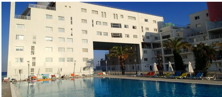
Figure.7 Hotel (B) Internal view

The significant problems of the building's planning failures are: its lack of an entrance gate, any logo or sign, no harmony, lack of suitable illuminating systems, a proper sewage system and waste disposal. To put it in a nut shell: this building can be listed as a real example where the sustainability criteria have been ignored. What was concluded from the data, these resorts and buildings almost have no benefit to the local community considering the economic aspects and environmental issues.