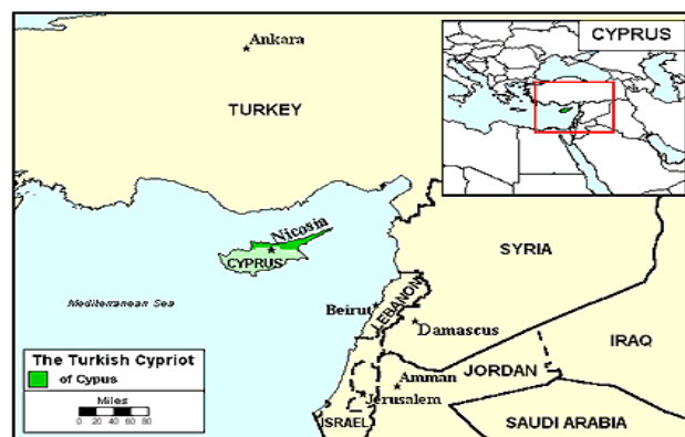
Figure. 2: The location of the Island

The third largest Mediterranean island after Sicily and Sardina is Cyprus, a typical small island with limited natural resources Fig. 2. The island is 224 km long and 96 km wide and has 768 km of coastline. Just nine years after the partition of the island to northern part (Turkish Cypriots) and southern part (Greek Cypriots) in 1974, the northern part was established as Turkish Republic on Northern Cyprus (TRNC) in November 1983.