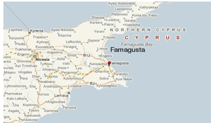
Figure. 3. The location of Famagusta

Famagusta is a city on the east coast of North Cyprus. It is located east of Lefkoşa, and possesses the deepest harbor of the island Fig. 3. This city of Famagusta offers many attractions to visitors, including beaches, nightlife, sightseeing, historical sites, Byzantine churches, and nature-based activities – not dissimilar to the tourism offerings and characteristics in the rest of Cyprus.