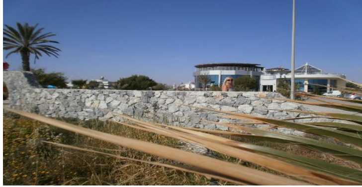
Figure.5 Hotel (A) and the buffer between the sea and the resort