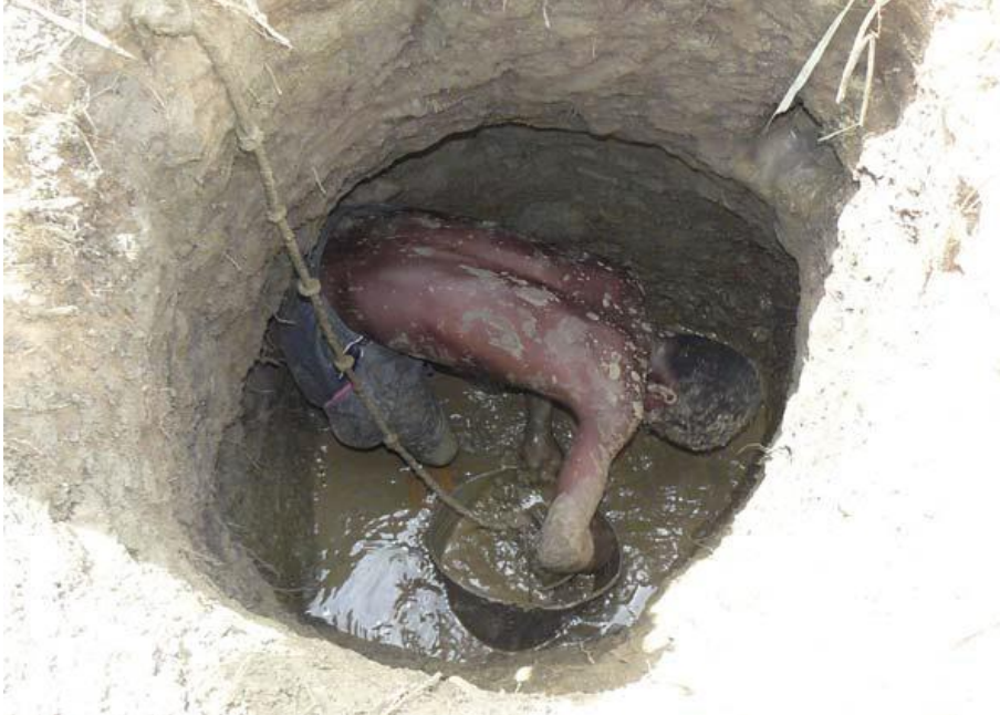
Figure 4: Dug-Out System in Upper West, Ghana.