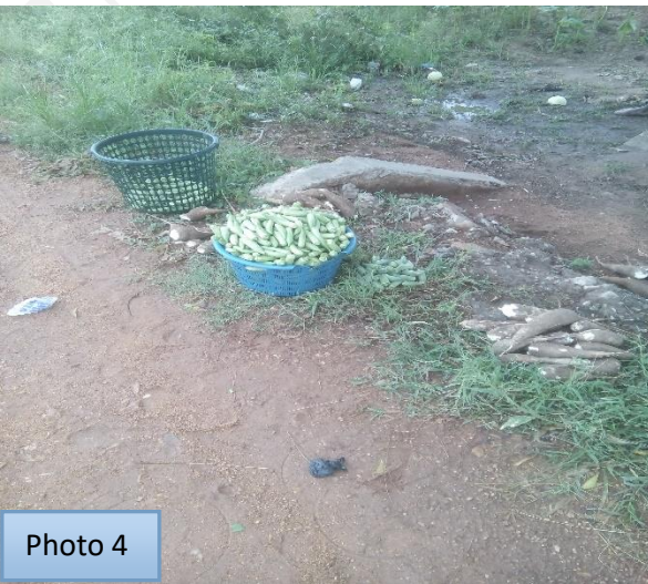
Figure 3 Poor Farm Management Practice