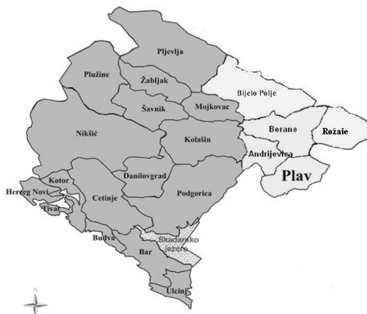
Figure 1 Regions Polimlje-Ibar on the map of Montenegro (Source: Regional Business Centre Berane (2004), marking regions was carried out by the author)

Meadows alternate with fields and orchards. Frequently occurring loam type of soil and forest soil. If we analyze the share of meadow in total agricultural area of the region and then they cover 34.80% or 44.543 ha. Soil and climatic conditions of the area Polimlje-Ibar, the best favor the spreading meadows, pastures and forests. Therefore, meadows and pastures in the total agricultural area participated with 85.61% or 109.596 ha. Pastures is 65.053 ha, or 50.82% of total agricultural land. Such a large percentage of meadows and pastures in are overall structure of agricultural land, indicating hilly mountainous regions Polimlje-Ibar.