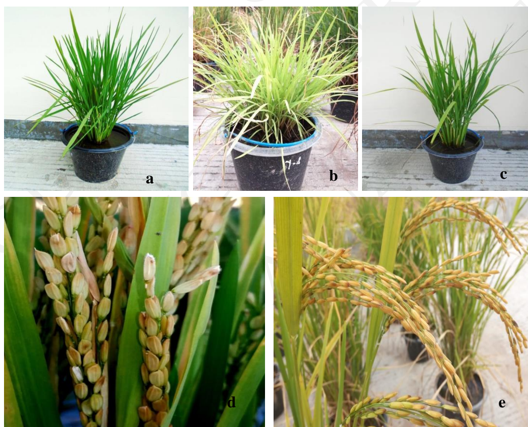
Figure 2. Ploidy level characterization by morphological characters (a) Normal plant type of Yar-8, (b) Abnormal plant type of Yar-8, (c) Normal plant type of F 1 , (d) Sterile panicle and (e) Fertile panicle