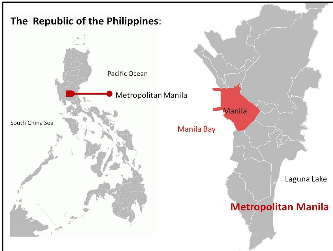
Figure 1: Map of the Manila Bay in National Context

take away the sunset view, is therefore perceived as removing these very dimensions of city life which for them is a destruction of their daily urban experience and attachment to the city.