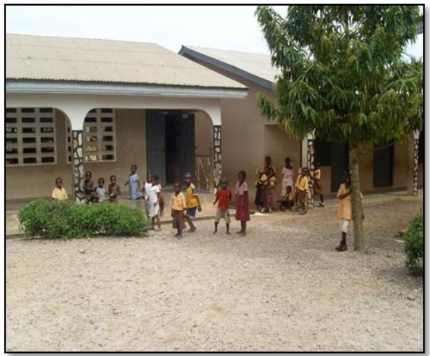
Plate 1: A New Classroom Block at New Atuabo