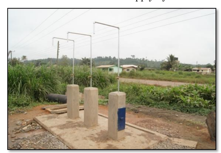
Plate 3: Small Town Water Supply System